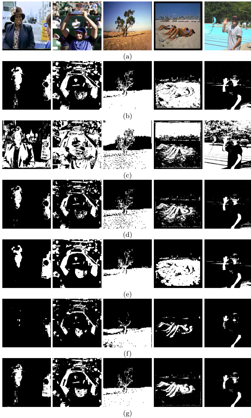
Fig. 1. Some example of skin detection results. (a) Original images. (b) Detection results with NRGB [18]. (c) Detection results with HS [8]. (d) Detection results with NRGB-HS [19]. (e) Detection results with CbCr [7]. (f) Detection results with the luminance method [4]. (g) Detection results with the proposed LCCS method.