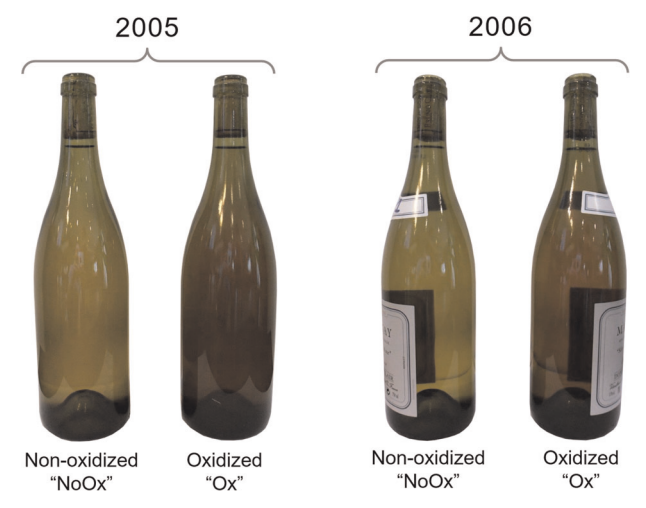
Fig. 5 Bottles analyzed in this study, from 2005 to 2006 vintages, originated from the same batch, with one suspected to be non-oxidized and one suspected to be oxidized

Panel. Fifteen enology students of the "Institut Universitaire de la Vigne et du Vin—Jules Guyot" at Burgundy University were selected among 28 candidates. They were specifically trained on wine oxidation and reduction, following a previously published strategy.<sup>9</sup> The training process lasted 10 weeks and was carried out in conjunction with their regular tasting lessons within the frame of